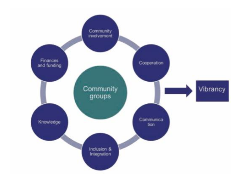
Fig.1: Categories that constitute the Rural Vibrancy Measuring Index elements

The next stage in the project is to test the "usability" of this index with an alliance.